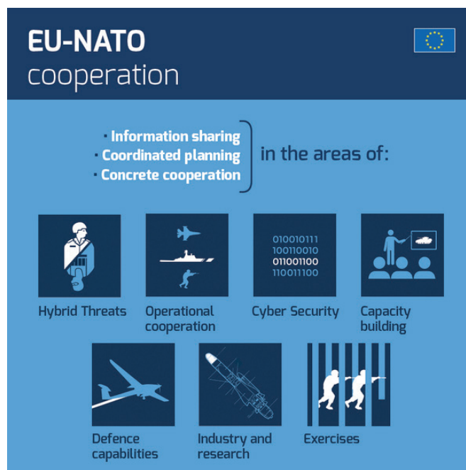
FIGURE 1 ■ Seven areas of EU-NATO cooperation

From 2014 onwards, this conflict started to unfreeze. At the margins of NATO's Warsaw Summit in 2016, the President of the European Council, the President of the European Commission and the NATO Secretary General published a Joint Declaration. It stated that it was time "to give new impetus and new substance to the NATO-EU strategic partnership". 12 The rationale was clear: we are facing common and increasingly hybrid threats and need to make the most of our mutual strengths and the members' limited resources. EU and NATO subsequently agreed on two sets of implementation actions in seven priority areas (see Figure 2). A first set of 42 actions was published in December 2016 and a second set of 32 actions followed in December 2017. 13